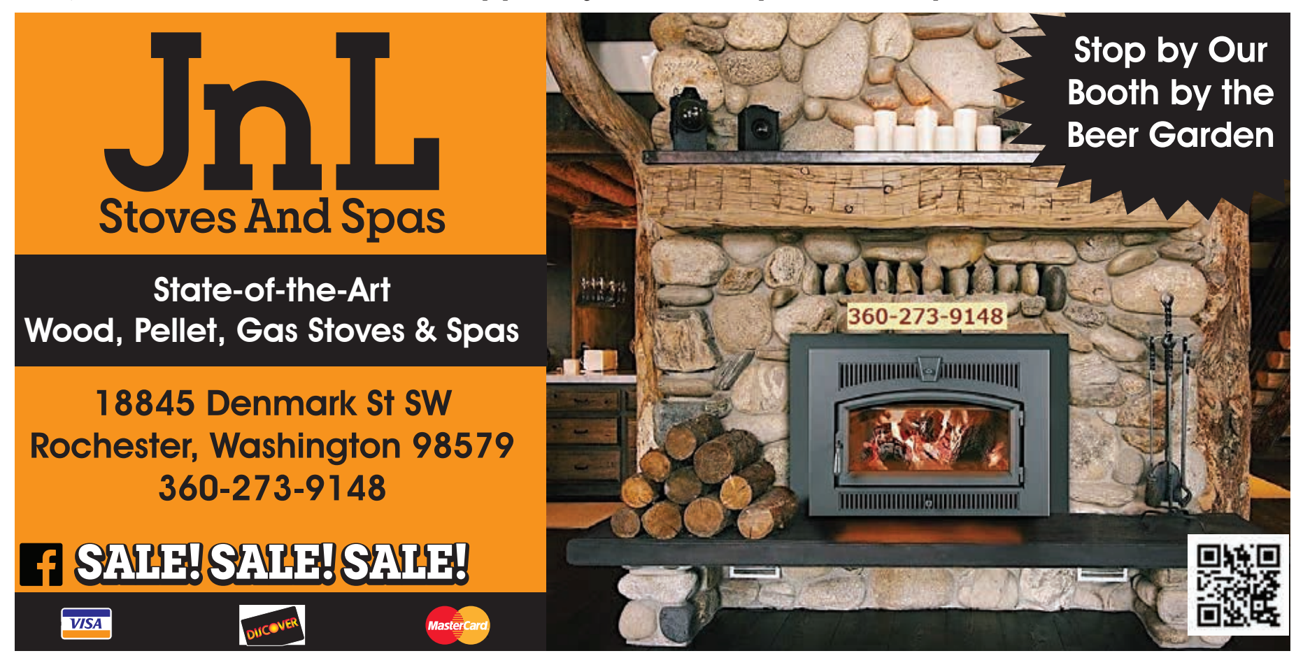
Southwest Washington Fair 2023 • The Chronicle, Centralia/Chehalis, Wash. - Thursday, August 10, 2023 • 21

For more information, call the fair office at 360-740-1495 or visit southwestwashingtonfair.org/events/ contests.