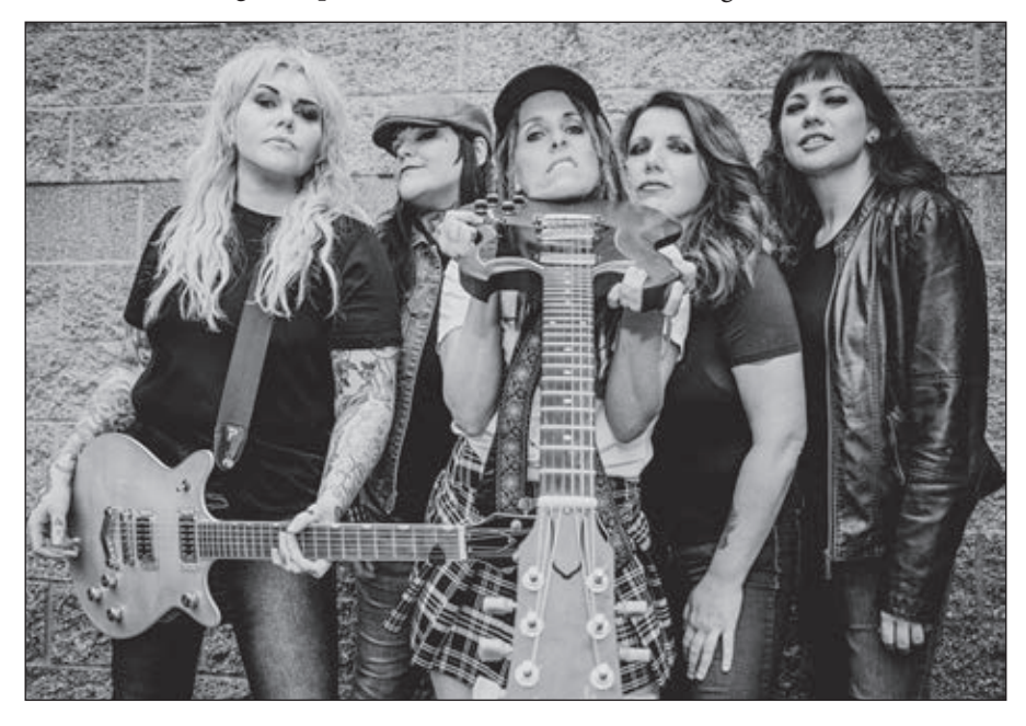
Hell's Belles will perform Saturday, Aug. 19 at 8:30 p.m. on the Saloon Stage.

1408 S Gold St #2, Centralia WA • 360-736-1336 • madsens1.com