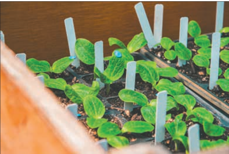
Plants grow from seeds in trays at the Blueberry Hill Nursery in Vader Tuesday afternoon.

Thelma Hauge shows off her own and student artwork displayed in a building on the same property as the Blueberry Hill Nursery Tuesday afternoon in Vader.