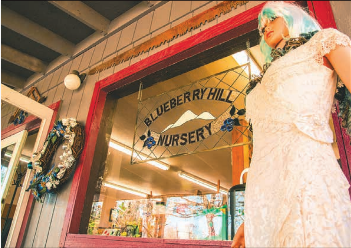
A mannequin stands next to signage for the Blueberry Hill Nursery in Vader on Tuesday.