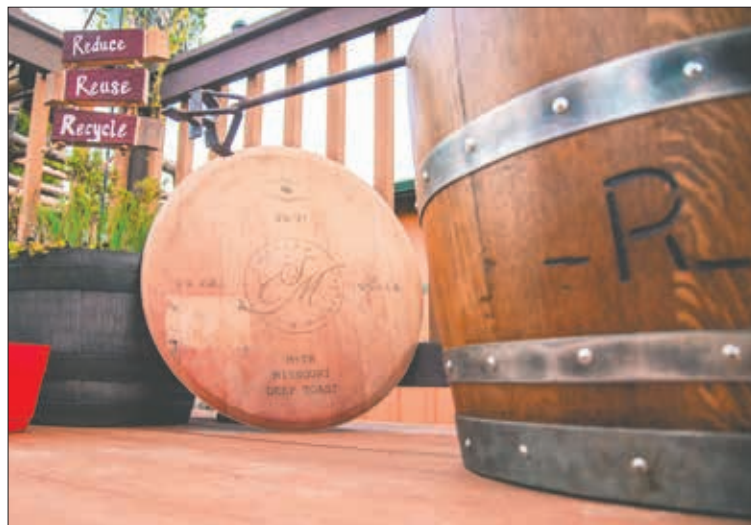
Bolan's Barrels of Fun works to reduce, reuse, and recycle in their craft.