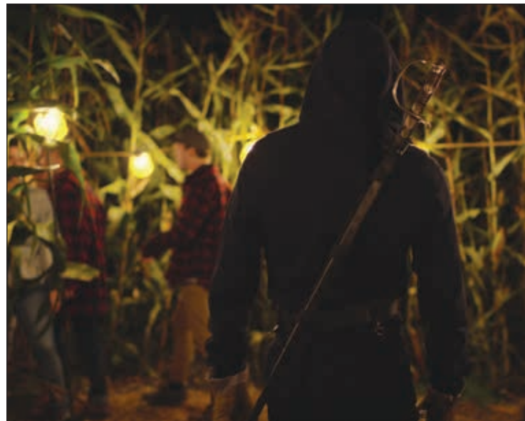
A scene from "There's Someone Inside Your House"