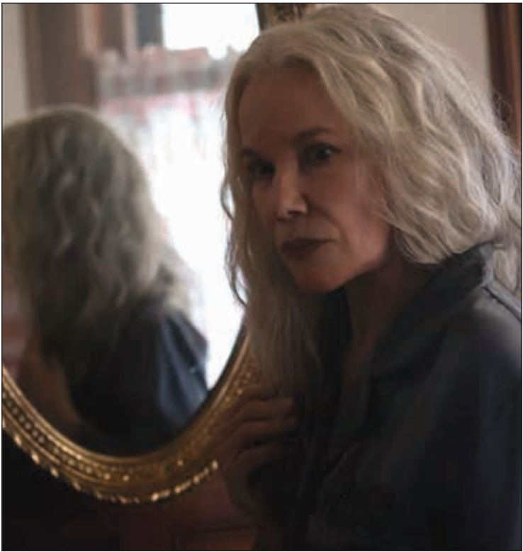
Barbara Hershey in "Welcome to the Blumhouse: The Manor"