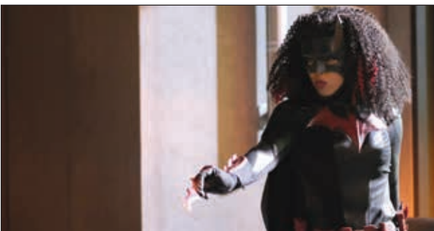
Javicia Leslie stars in "Batwoman"

Jeff Probst hosts another new episode of this long-running series' 41st season. A group of contestants battles it out through a series of challenges on a deserted island, each hoping to make it to the finale without getting voted off the show.