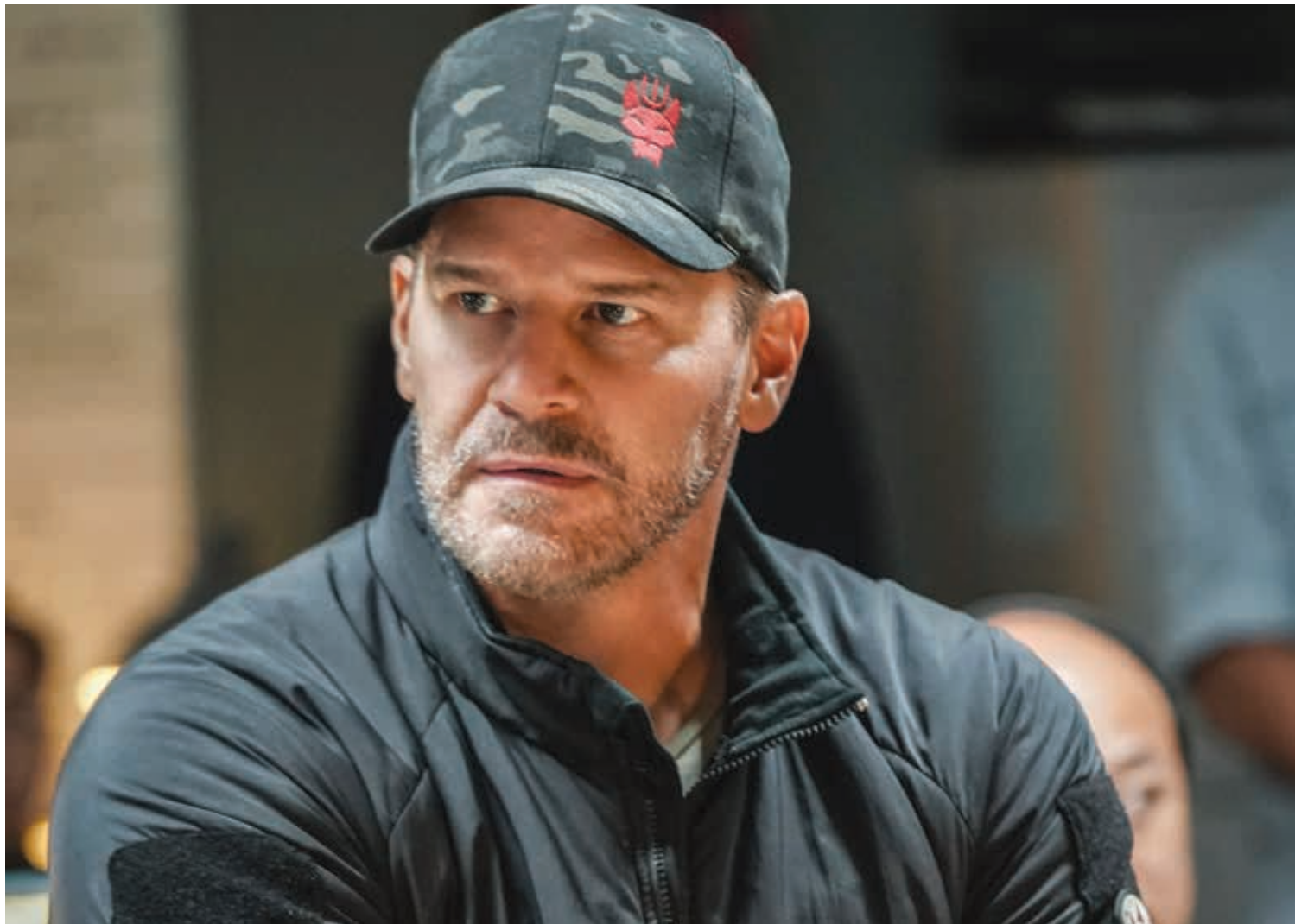
David Boreanaz in "SEAL Team"

Jason finally convinced Ray to get therapy, and after months of fighting,