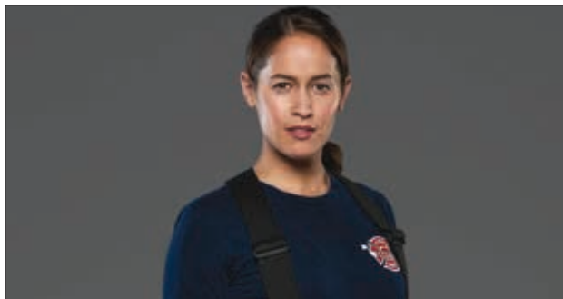
Jaina Lee Ortiz stars in "Station 19"

This sitcom rebroadcast stars Parker Young as a newly returned marine veteran trying to readjust to life back in Ohio. Meanwhile, Al (Adhir Kalyan), an Afghan interpreter who served alongside him, is enjoying many exciting 'firsts' as a new American.