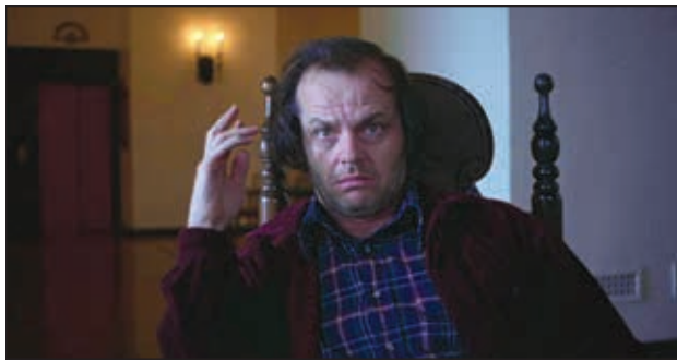
Jack Nicholson stars in "The Shining"

This Jack Nicholson-led horror masterpiece from director Stanley Kubrick marks the halfway point of today's Stephen King marathon. When an author takes his family to an isolated hotel so he can write in peace, he is possessed by spirits from the past.