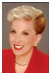
By Abigail Van Buren

DEAR ABBY: My son and his wife have been living with us for two and a half years so they can save for a house. Recently, my best friend told me that a mutual acquaintance spotted a picture of my son and his wife on a swinger website. At first I discounted it. Then I started noticing they were going out every Friday and Saturday night. My daughter-in-law was usually dressed provocatively, and they wouldn't get home until around 5 or 5:30 a.m. My husband and I are both Christians. Neither of us feel comfortable about the situation. What do you recommend we do? -- INCREDULOUS IN TEXAS