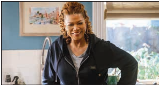
Queen Latifah stars in "The Equalizer"

As she considers stepping down as The Equalizer, McCall (Queen Latifah) is called back into the job by an insistent new client, Det. Marcus Dante (Tory Kittles). Dante needs her help finding an untraceable band of bank robbers in this Season 2 premiere.