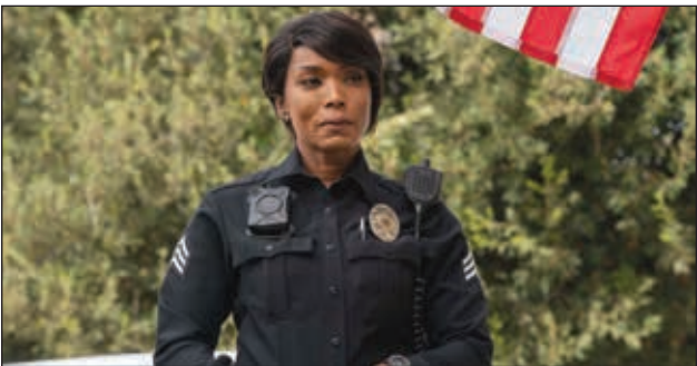
Angela Bassett stars in "9-1-1"

White Midwesterners Dave (Max Greenfield) and Gemma (Beth Behrs) move to a historically Black L.A. neighborhood and manage to bond with their neighbors (Cedric the Entertainer and Tichina Arnold) despite vast cultural differences in this rebroadcast.