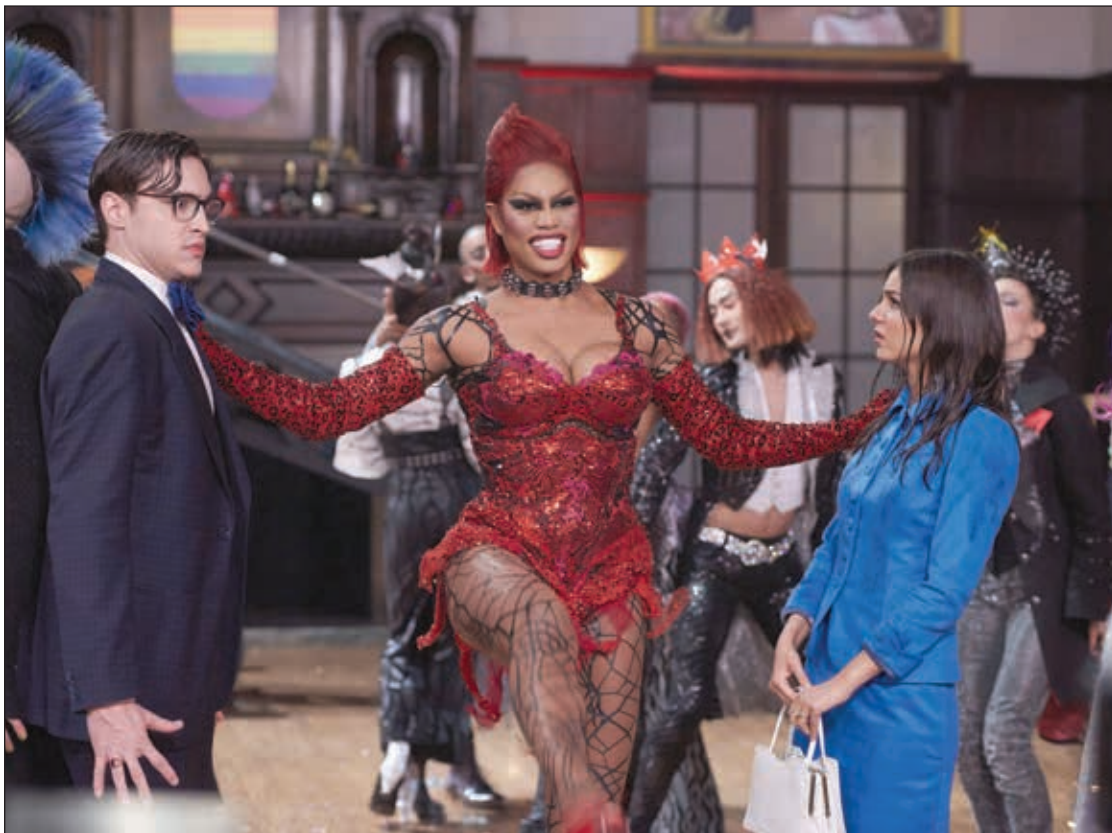
Ryan McCartan, Laverne Cox and Victoria Justice in "The Rocky Horror Picture Show: Let's Do the Time Warp Again"