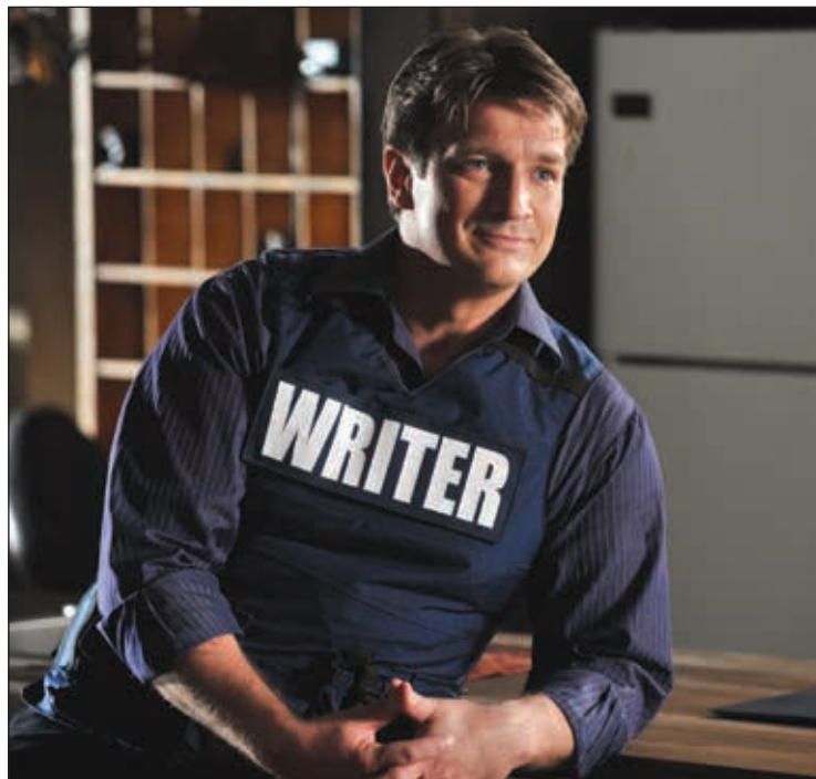
Nathan Fillion stars in "Castle"