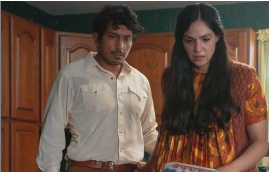
Tenoch Huerta and Ariana Guerra as seen in "Welcome to the Blumhouse: Madres"