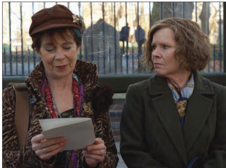
Celia Imrie and Imelda Staunton in "Finding Your Feet"

Sandra (Imelda Staunton, "Harry Potter and the Order of the Phoenix," 2007) is about to retire and settle into a more-than-comfortable life of luxury in her English town. However, on the eve of her retirement, Mike asks for a divorce and Sandra learns that Mike has been having an affair with her best friend, Pamela (Josie Lawrence, "EastEnders"). Unable to turn to her once-best friend for comfort, Sandra pays a visit to her older sister, Bif (Celia Imrie, "The Best Exotic Marigold Hotel," 2011), from whom she has been estranged for more than a decade due to their irreconcilable differences. While Sandra believes Bif takes nothing seriously, Bif is disappointed in her little sister for settling into a posh life with Mike and losing the joie de vivre that once made her so empowered. Now back together and forced into forming a new relationship, Sandra hoped to find her feet again alongside the sister she never quite came to understand. Directed by Richard Loncraine ("Wimbledon," 2004), "Finding Your Feet" also stars Timothy Spall ("Mr. Turner," 2014), Joanna Lumley ("Absolutely Fabulous"), David Hayman ("The Boy in the Striped Pajamas," 2008) and Phoebe Nicholls ("The Elephant Man," 1980).