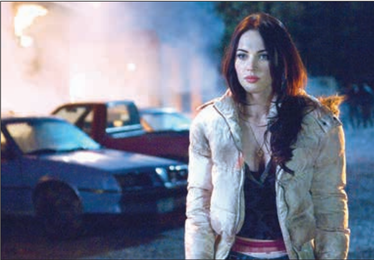
Megan Fox stars in "Jennifer's Body"